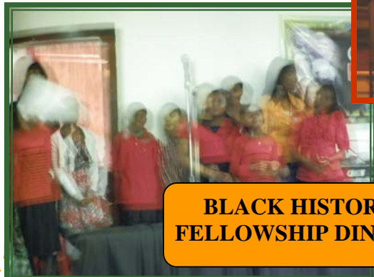
BLACK HISTORY FELLOWSHIP DINNER