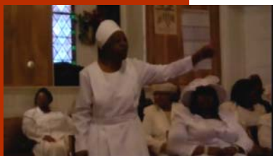
To God Be The Glory!